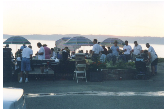
The neighborhood turns out for the Bootlegger Bash.