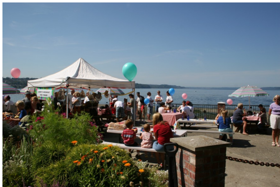
All parade participants gather at the plaza for hot dogs, games and festivities.