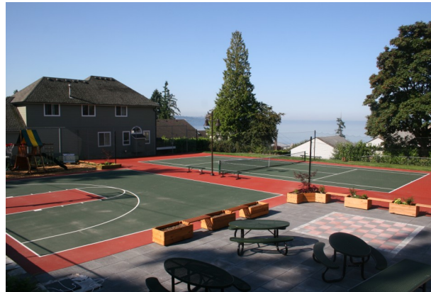
Our newest amenity: An updated tennis court and a new basketball court, kids play area and picnic area in Upper Woodmont.