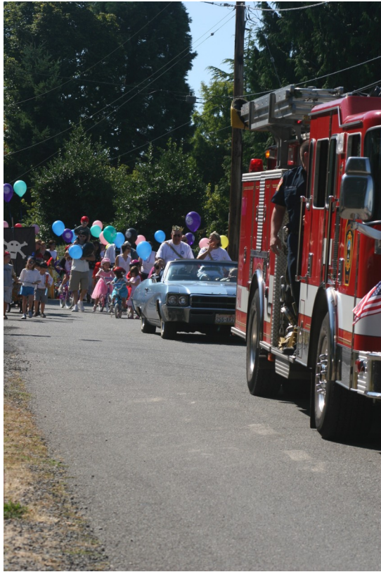
Corky's Kids' Parade heads down 8th Avenue.